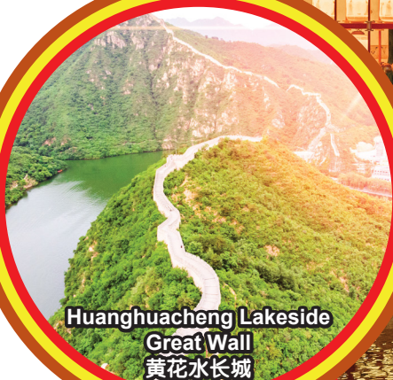
Huanghuacheng Lakeside Great Wall 黄花水长城