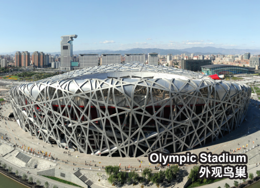
Olympic Stadium 外观鸟巢