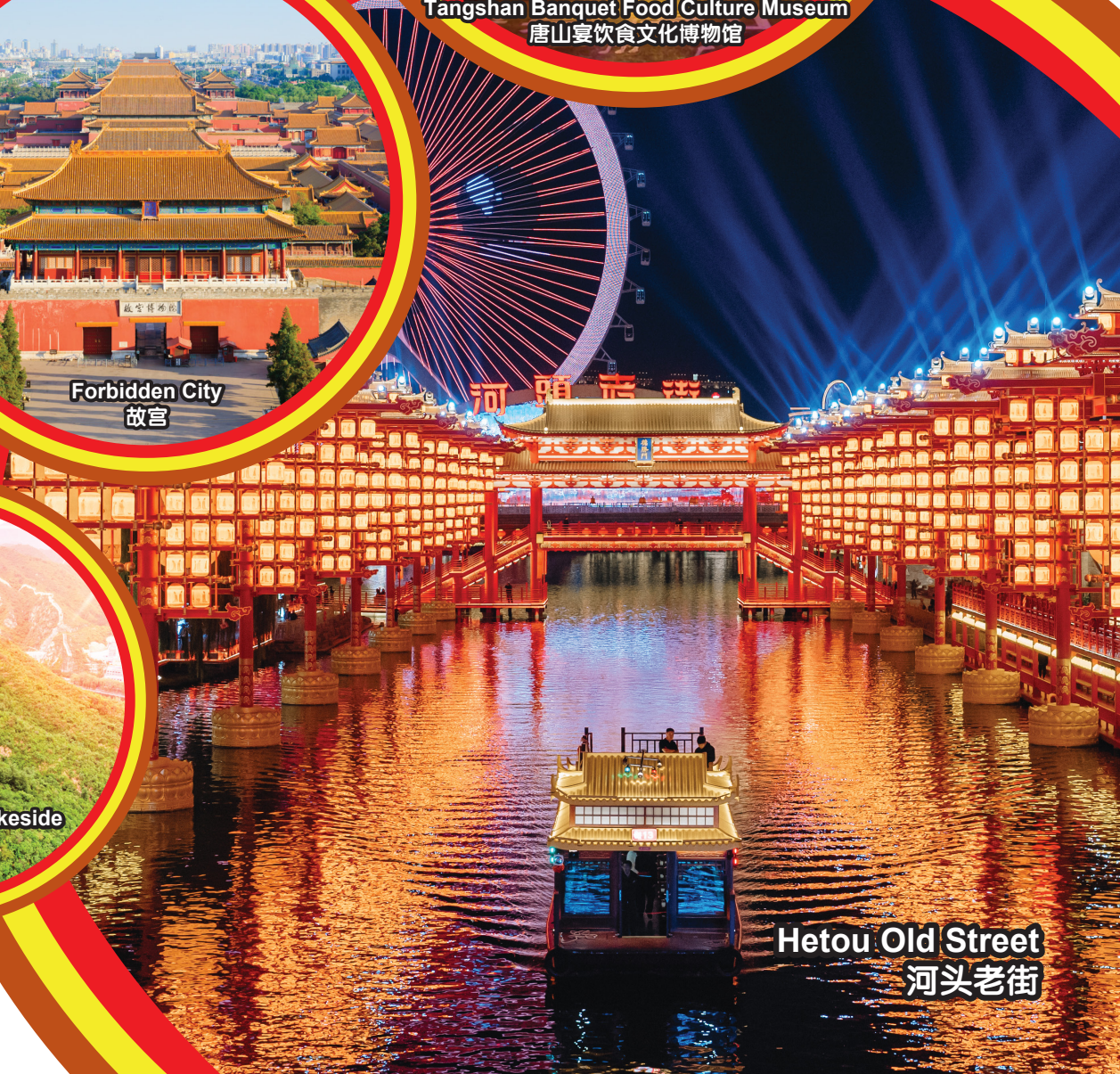
Hetou Old Street 河头老街

行程次序，以当地旅社安排为准。 Sequences of Itinerary are subject to local arrangement.