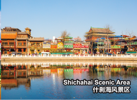
Shichahai Scenic Area 什刹海风景区