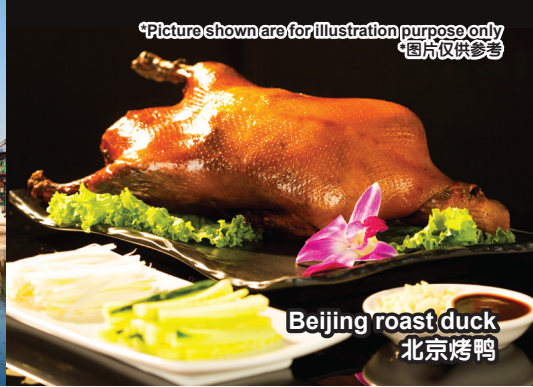
Beijing roast duck 北京烤鸭