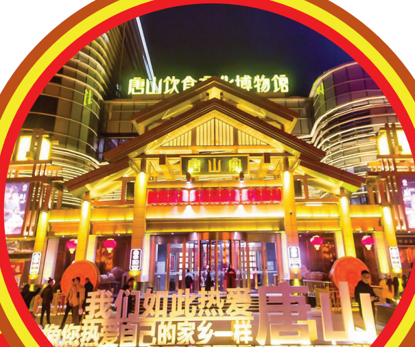
Tangshan Banquet Food Culture Museum 唐山宴饮食文化博物馆