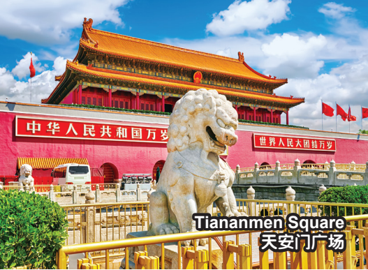
Tiananmen Square 天安门广场