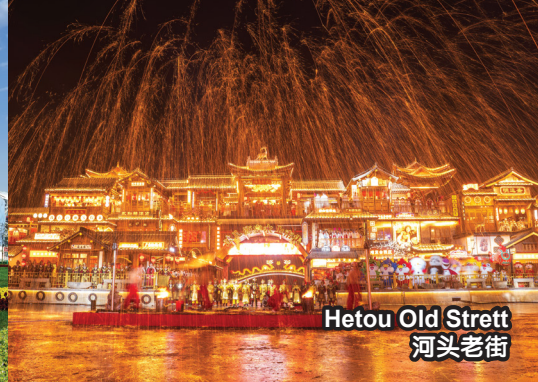
Hetou Old Street 河头老街